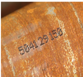
Height Adjustment for Round Parts