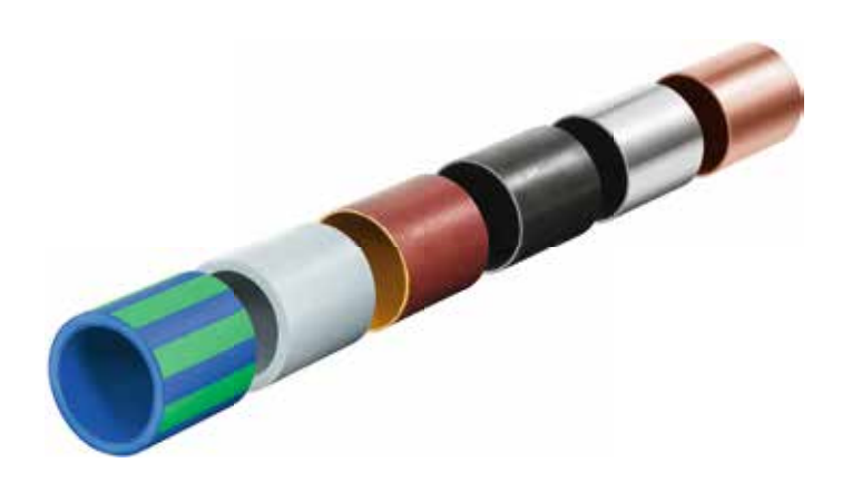
Tested by electrosuisse