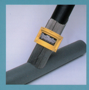
2. Push down