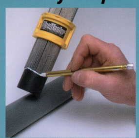
3. Transfer & cut