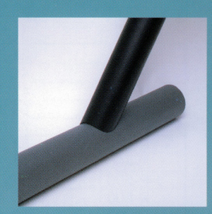
4. Ready to weld