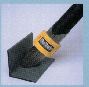
Accurate fits in 4 easy steps!