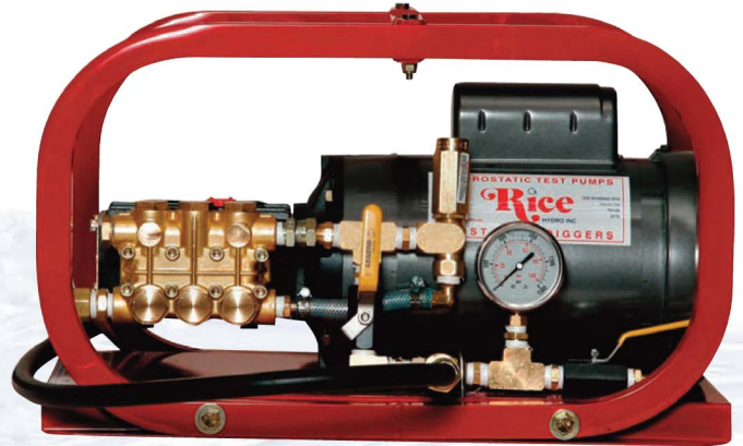
EL-2 · 1.5 GPM · 1000 PSI