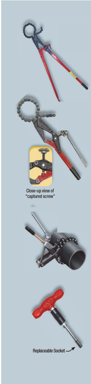
Close-up view of "captured screw"

275410 5/16" Replacement Socket 275818 3/8" Replacement Socket