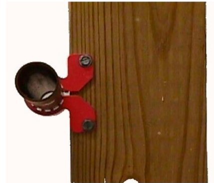
Use in pipe chase or on side of stud.