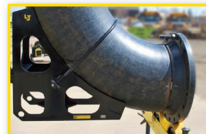
Fasten elbow into the jig.