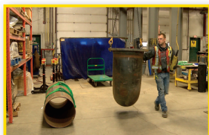
Load elbow into jig.