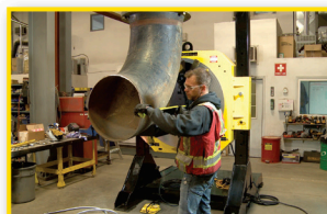
Measure the fit.