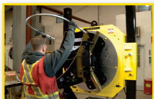
Remove hold down u-bolt.

45° and 90° Elbows: Precision fit and clamp allows for quick and easy fitting, prepping and welding of elbows for use with welding positioners.