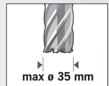
Core drilling up to \varnothing 35 mm