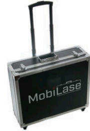
45-lb. all-in-one rolling suitcase