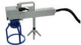
Two handheld bracket options included