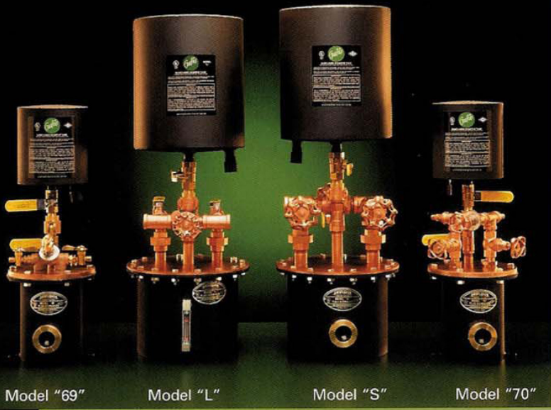
Model "69" Model "L" Model "S" Model "70"

All Gasfluxers can be easily maintained, regulated, and refilled by one operator.