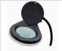
Item No. 18070 LED lighted precision optical lens