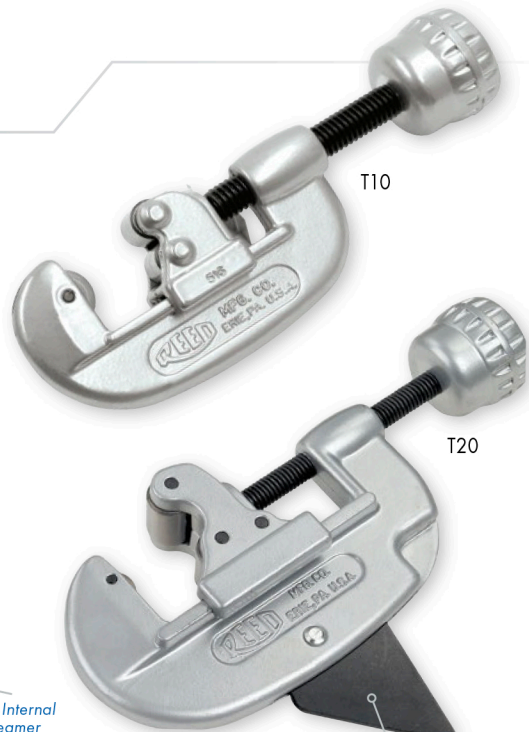
Fold-Out Reamer Extended