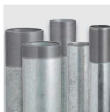
Made in Germany