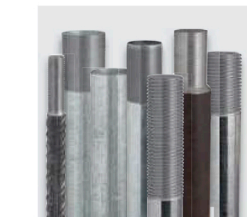
Made in Germany