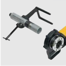
Made in Germany

Ideal tool for working up short pipe pieces! Saves time and money!