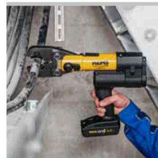
Tested by electro suisse >>>