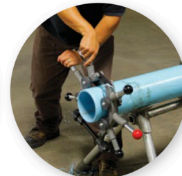
PLASOH Hand-Over-Hand in use