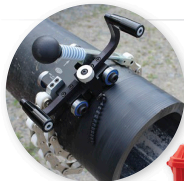
PEPEEL12 in use