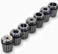
Collet set Item No. 16398 7 pcs. for BKS (8/10/12/14/16/18/20 mm)