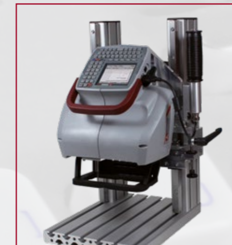
Column frame for small parts (optional) (FlyMarker® mini 120/45)