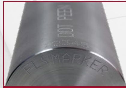
Round part marking