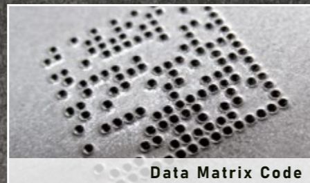
Data Matrix Code