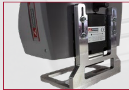
Removable Positioning Plate (optional)