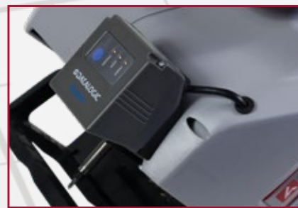
Integrated Barcode Scanner (optional)