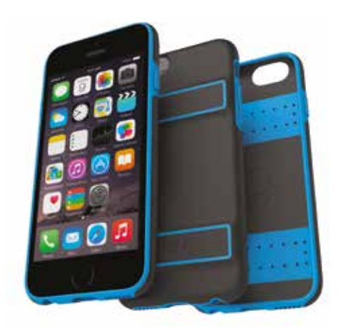
iPhone® 6 Plus