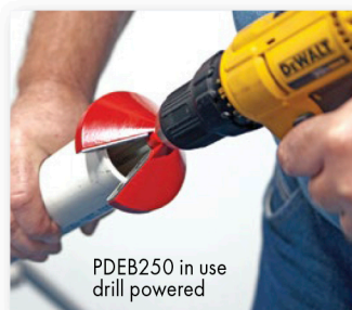
PDEB250 in use drill powered