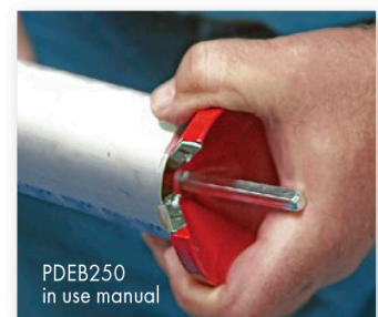
PDEB250 in use manual