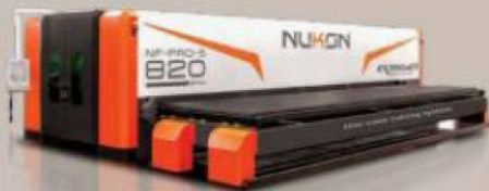
NF-PRO-S 820 / NF-PRO-S 1020

Suited to the most challenging of applications, and are ideal for precision-cutting pre-formed tubes, pipes and profiles in a wide range of materials. Typical applications include automotive panels, intricate 3D shapes, bespoke and R&D work.